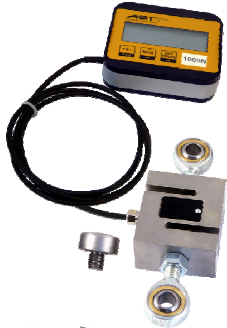
force Indicator pro